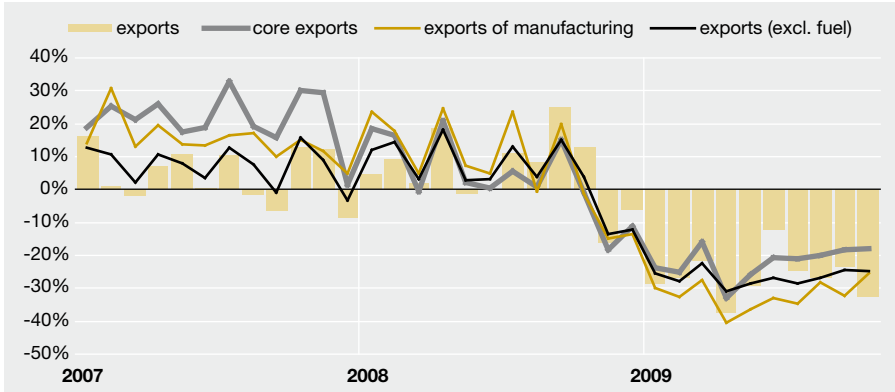
Figure 1. Growth in core exports

Until the end of 2006, the developments of core exports were quite similar to the developments of oil exports, but in 2007, the growth rate of core exports was higher. However, in light of the events of the second half of 2009, exports as well as core exports have decreased, even though the latter has declined somewhat slower (see Figure 1).